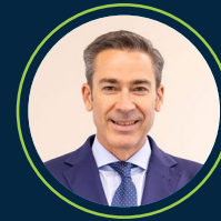
Nacho de Miguel Peninsula