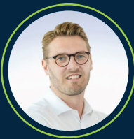
Jonas Bentsen Peninsula