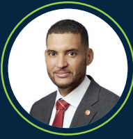
Yamil Lasten Curoil NV