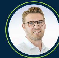
Jonas Bentsen Peninsula