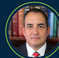
Romano Feoli Feoli & Co