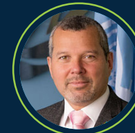
Arsenio Dominguez International Maritime Organization