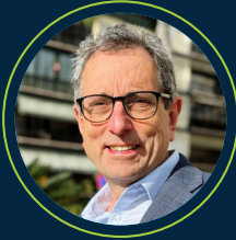
Llewellyn Bankes-Hughes ship.energy