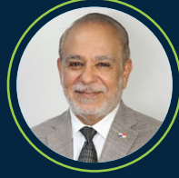
Rodolfo Sabonge Ministry of Economy and Finance, Republic of Panama