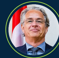
Amb. Sander Cohen Embassy of Netherlands in Panama