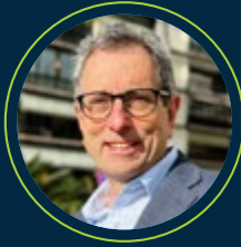
Llewellyn Bankes-Hughes ship.energy