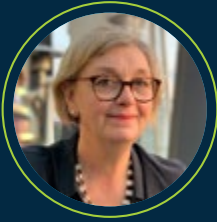
Lesley Bankes-Hughes ship.energy