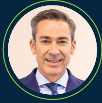
Nacho de Miguel Peninsula